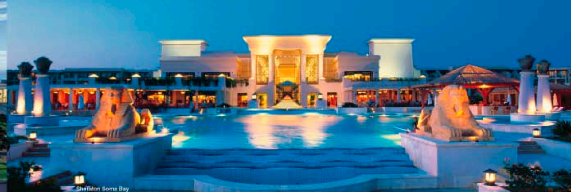
Sheraton Soma Bay