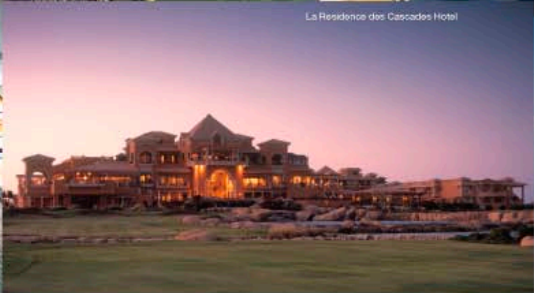
La Residence des Cascades Hotel

and counter-currents, and showers, each designed to revive and tone a specific part of your body. All throughout the pool, you are standing or sitting completely immersed in seawater but the jets are located at higher and higher points as you move from zone to zone, so that, effectively, the first zone begins at your ankles and you move along till you reach your upper back and neck. I also followed one of the instructors to perform some of the exercises against the water current. It was quite a challenge, but was formidable for muscle toning. When I had had jet massages galore, I went for a tan by the outdoor heated seawater pool, all the while ordering water and fresh juices from the spa's Health Bar.