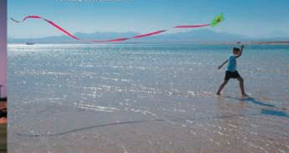
Soma Bay's beautiful waters.

The guests are drawn to Robinson Club because it offers extensive sports facilities include diving, snorkeling, windsurfing, sailing, archery, tennis, aerobics, pilates, stretching, as well as a gym and aerobics center.