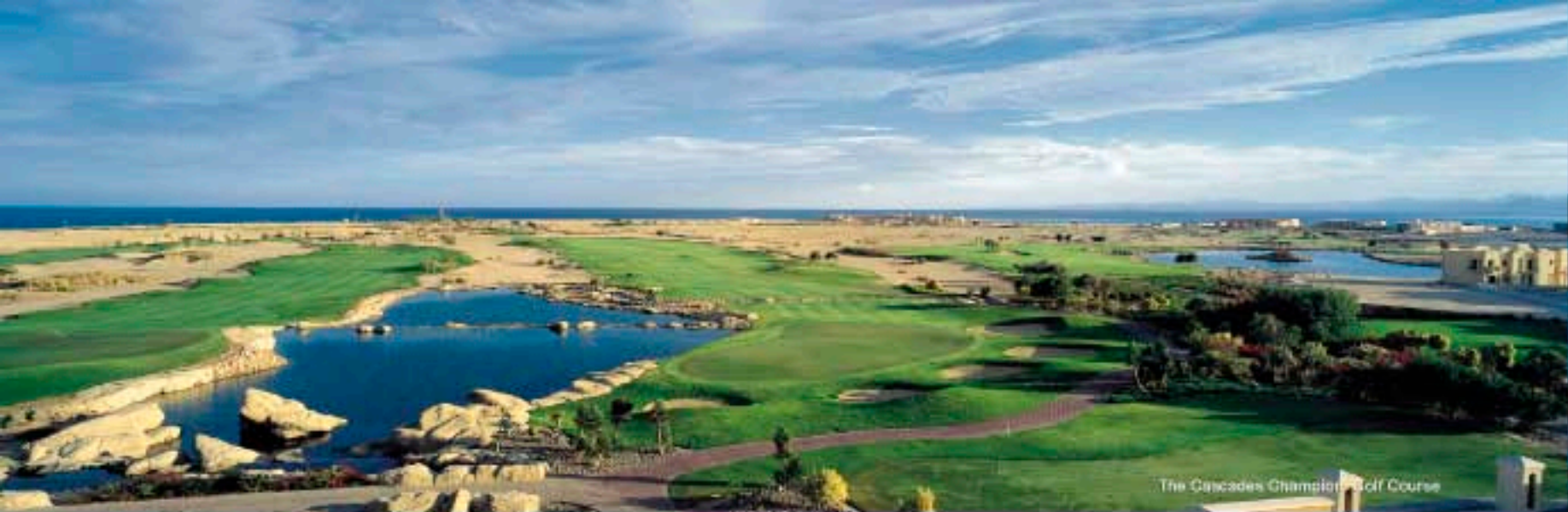
The Cascades Championship Golf Course